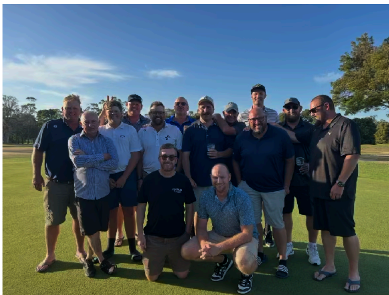
The Sponsors of this event (The Sultans of Swing)