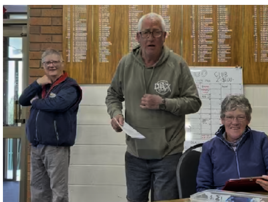
Wazza the Auctioneer