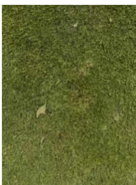
Repair Pitch Marks