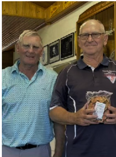
Loyal Eastley Perfect Card