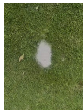
No cigarette Butts on the Course