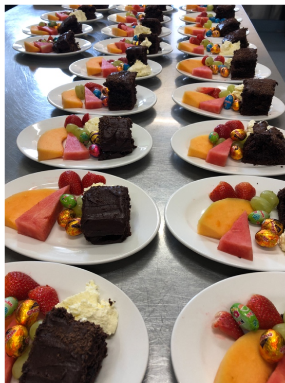
Cherry Picking and just deserts for the workers