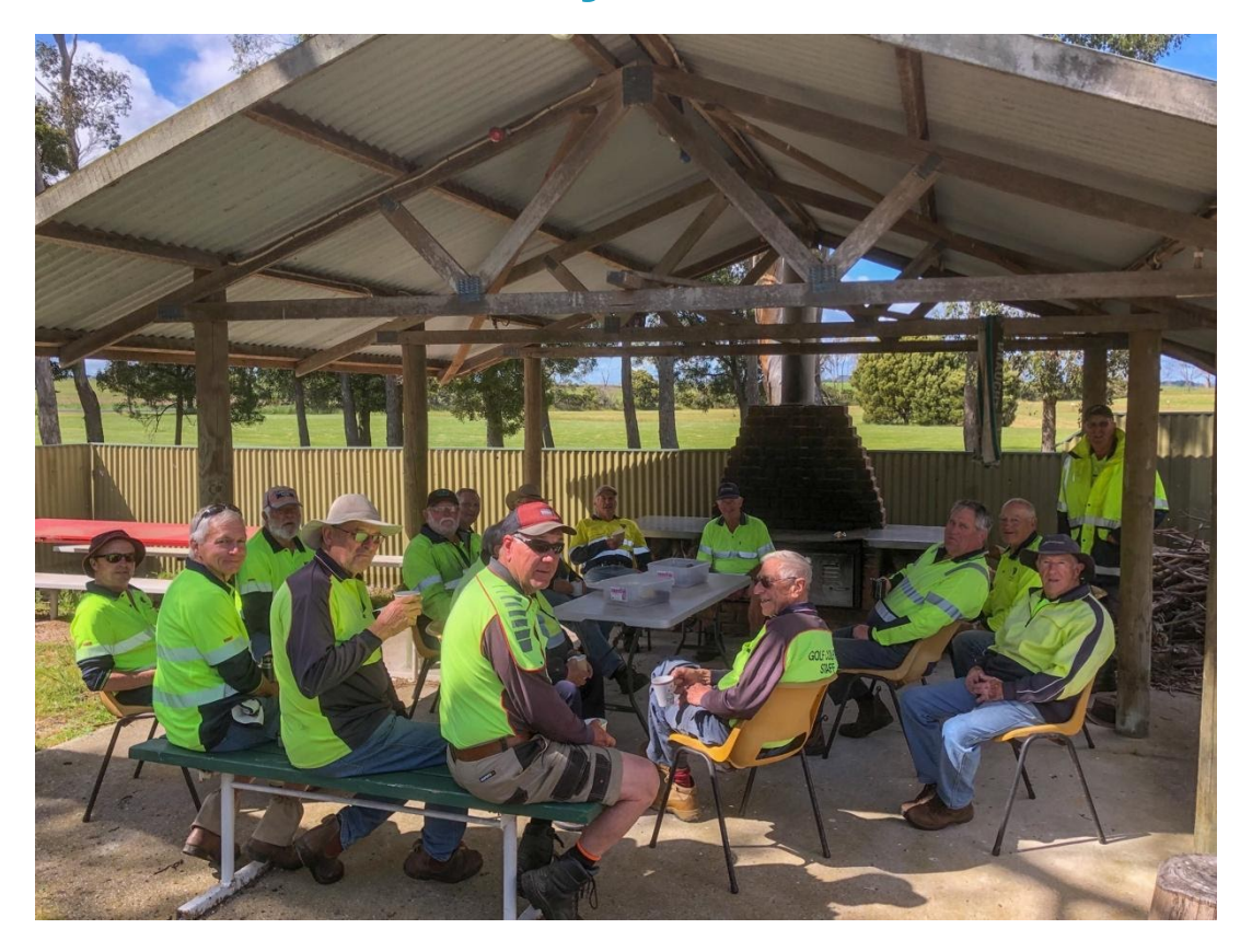
Our hard-working volunteers relax after another day on the course.