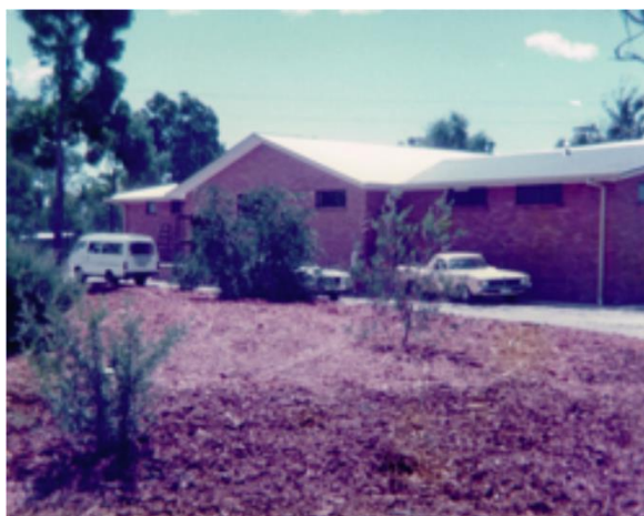
In the Beginning