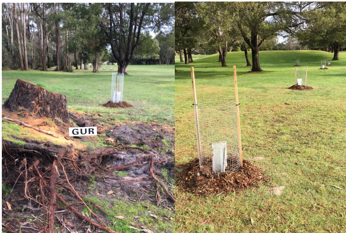
New Replacement Tree Planting